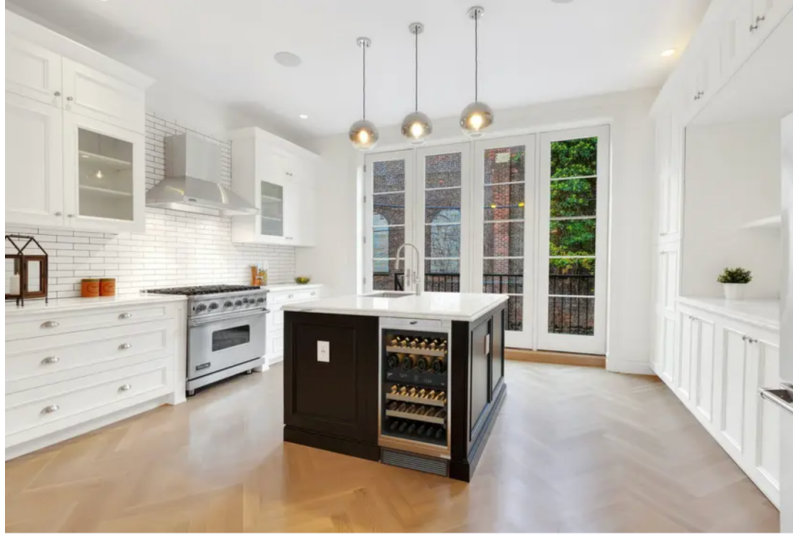
Kitchen with undercounter wine fridge

After navigating the quirks of New York City's real estate market and closing the deal, buyers can finally begin to settle into the rhythms of their new neighborhood and city life. That means everything from mastering the subway to discovering local dining and entertainment spots.