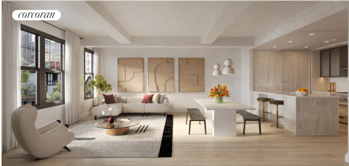
720 West End Avenue, #3F