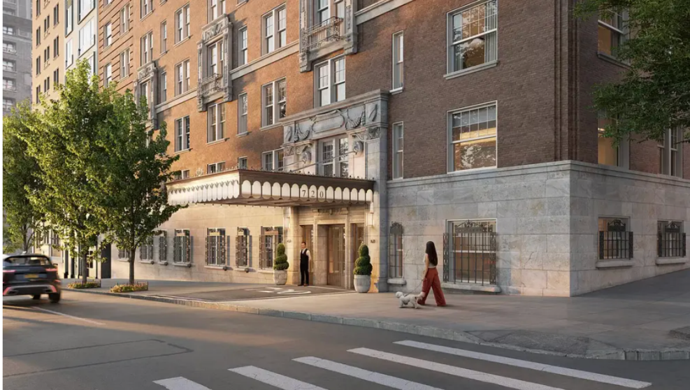
720 West End Avenue (Corcoran Group)